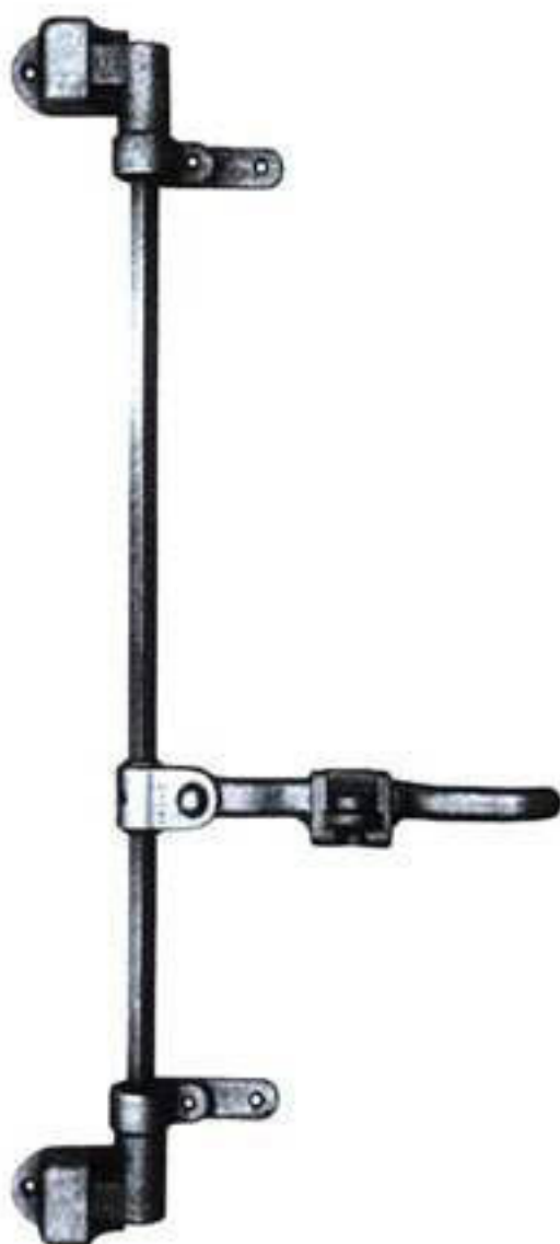
No. 172 2-Point Cam Lock Weight 20 lbs.

Available: - 304 Polished Stainless Steel - Ductile Iron - Zinc Plated & Gray Powder Coated